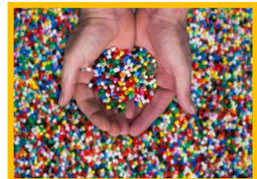
Recycled Plastic Pellets

just help the environment, it's a lively, fascinating world of fluctuating value, high-tech equipment, and expanding markets.