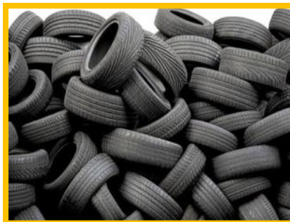
Tires, tires, tires

Got Tires? The Utilities Branch and Keep Pasco Beautiful, an environmental nonprofit, are partnering to promote proper tire disposal. To that end, Sunday, September 20th, 2015 is a BOGO (Bring One; Get one) event at the West Pasco Resource Recovery Facility at 14606 Hays Road in Springhill from 7a.m. until 11a.m. For each tire a county resident pays to dispose of, Keep Pasco Beautiful will pay for a second tire, up to 10 tires per vehicle in total. This exciting pilot collection event is designed to keep tires from becoming roadside debris.